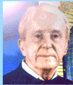
Vatican Intrigue What will come?